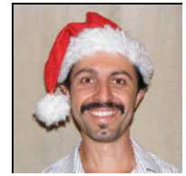
From the desk of Aaron Dwyer (owner)

The switch from purchasing from a real store to shopping online is happening ever so slowly, but it's happening, and if you own a bricks and mortar business, you best be get cracking at making it a bricks and clicks business, selling your product / service online and getting your online presence as strong as it can possibly be. If you don't, one of your competitors will.